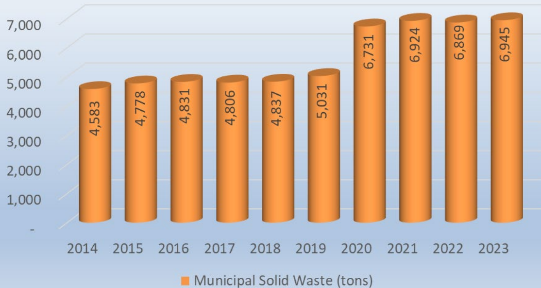
Collected & Transported