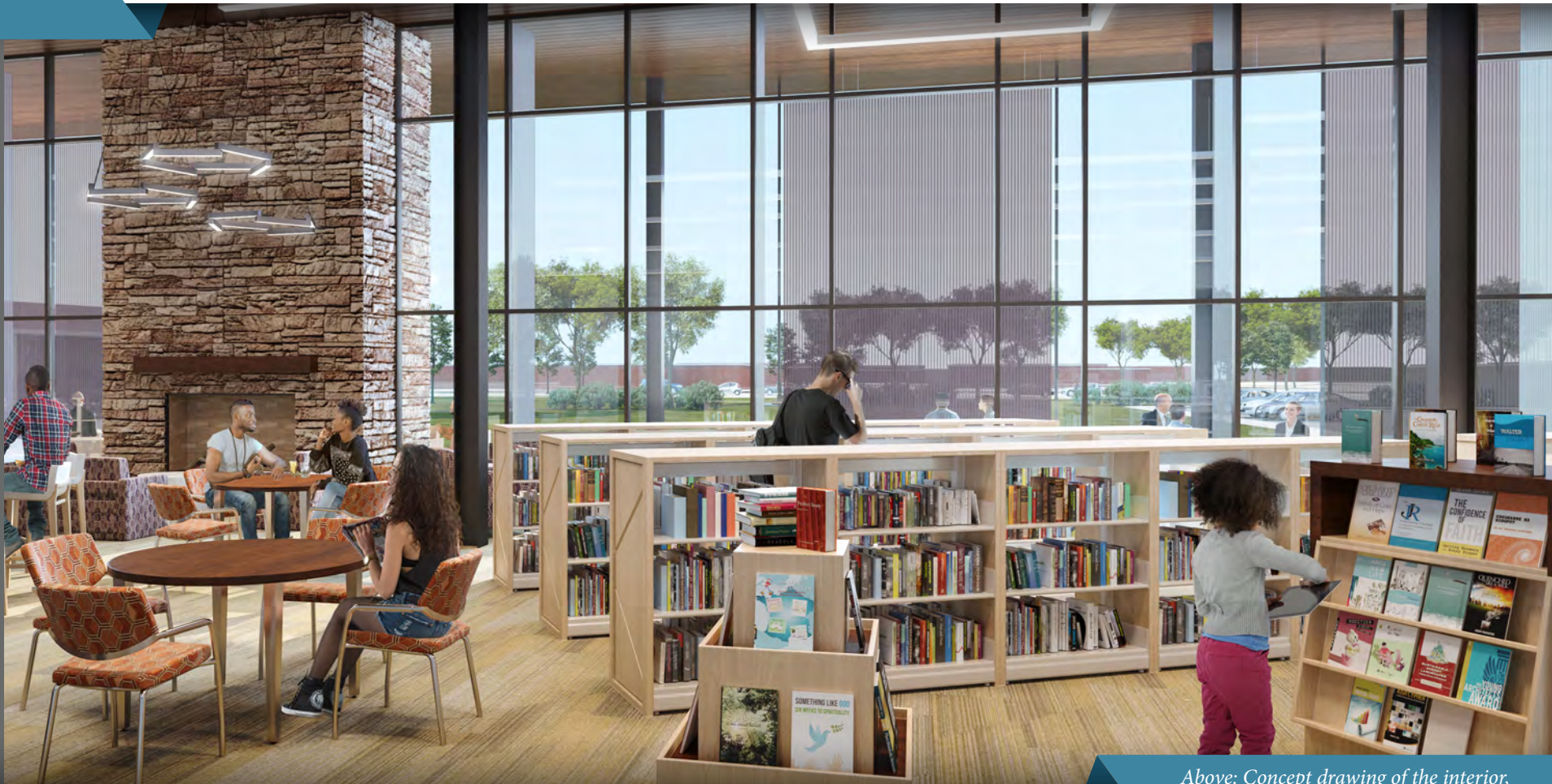
Above: Concept drawing of the interior, community space within the library.